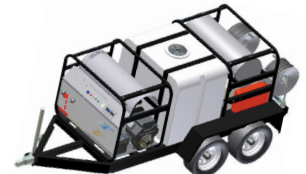
Dual Skid Trailer